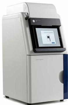
Amersham Imager 600

Amersham Hyperfilm product range are trusted products for sensitive, qualitative chemiluminescent detection in Western blots.