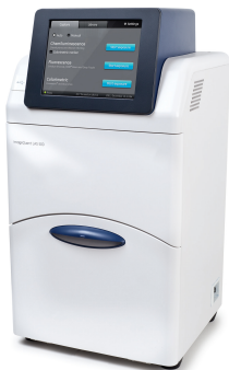
ImageQuant LAS 500